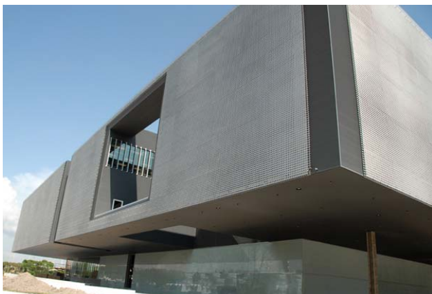
Tampa Museum of Art features McNICHOLS Perforated Metal.